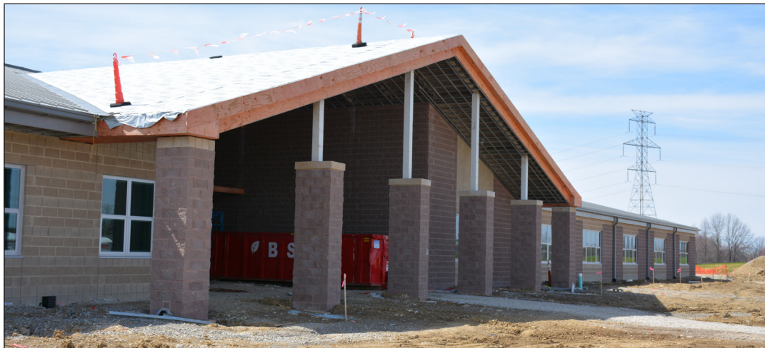
Construction of Shale Meadows Elementary School is well underway. The school is among projects being funded by passage of the March 2020 levy.